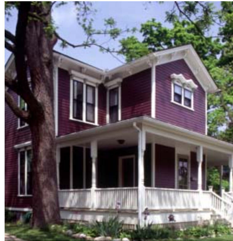
306 South Huron Street, Diana Green