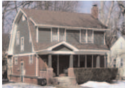
1120 Pearl Street c.1928 – Colonial Revival