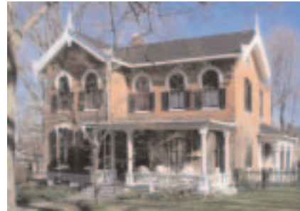
101 East Forest Avenue c.1873 –Italianate

Have you visited the YHF website lately? There are new features you may find interesting • www.yhf.org