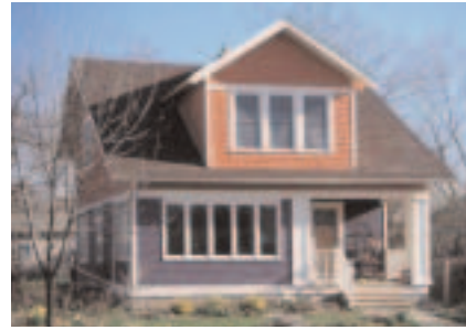
109 North Street c.1850 – Craftsman