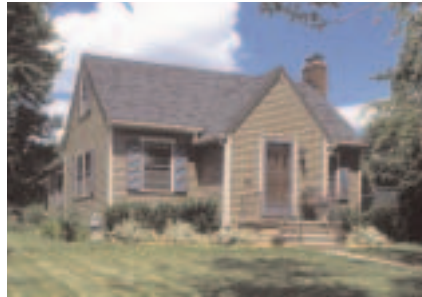
321 High Street c.1939 – American Vernacular