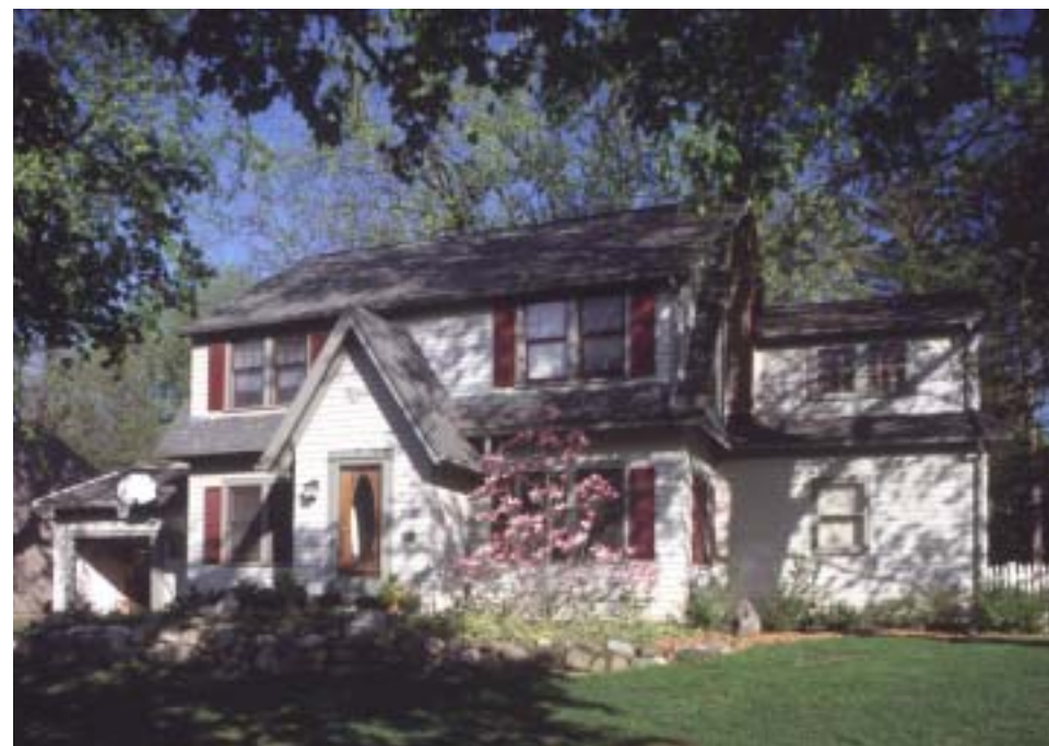
702 Collegewood Drive, Vince and Cheryl Zuellig