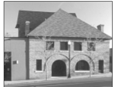
11 West Michigan Avenue

This year's tour revisits the Flour Mill Building in downtown Ypsilanti, recently renovated by Phoenix Contractors, Inc., and considered a landmark at the eastern gateway to the historic Michigan Avenue business district.