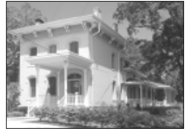
318 West Forest Avenue

The exterior of this Italianate house, probably built in 1876, has been painted a cheerful yellow. Passersby are drawn to the house—which looks both imposing and approachable—by its stately style and sunny demeanor.