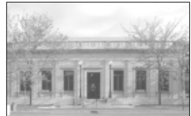
229 West Michigan Avenue

This old post-office building is typical of the classical revival style common to government buildings of the first half of the twentieth century. Its design owes much to the Beaux-Arts tradition prized by architects trained in Paris at the end of the nineteenth century.