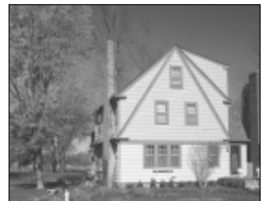
122 Linden Court

Linden Court is a cul de sac of twelve homes in the Woods Road Subdivision off of Summit Street. Built in 1930 as Linden Place, all of the houses were completed by 1931.